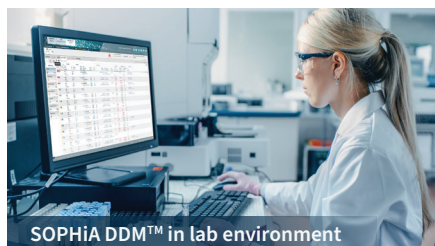
SOPHiA DDM™ in lab environment

SOPHiA GENETICS is the creator of SOPHiA DDM™, a cloud-based platform capable of analyzing data and generating insights from complex multimodal data sets and different modalities. The SOPHiA DDM™ platform enables healthcare institutions to get quick, robust insights from their data. We apply our technology to areas such as cancer and inherited disorders, where combining genomic and phenotypic information is vital to support research and drug development efforts.