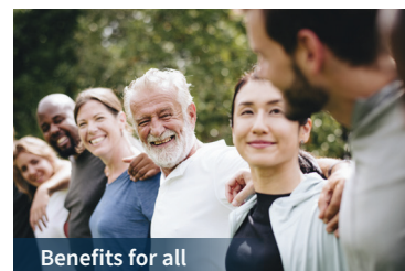
Benefits for all

SOPHiA GENETICS' data-sharing methodology also helps researchers and healthcare professionals work together as a community by sharing and leveraging patterns identified via artificial intelligence and machine learning. Our universal platform is designed to improve as we analyze more data over time.