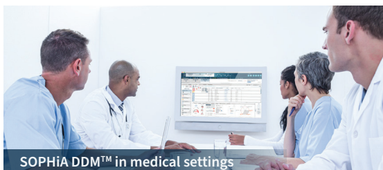
SOPHiA DDM™ in medical settings